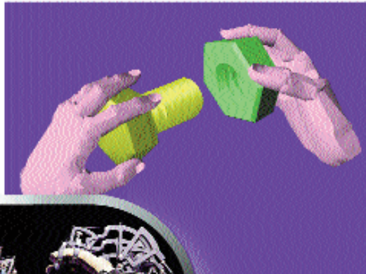
The CyberGrasp “hand-referenced” haptic feedback

The CyberGrasp hardware is a lightweight, force-reflecting exoskeleton that slips over a CyberGlove ® device and provides grasping force feedback to each finger relative to the palm. With the CyberGrasp force feedback system, you're able to feel the size and shape of computer-generated 3D objects you're holding in a simulated virtual world.